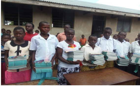
Pupils receiving scholastic materials.

Livelihood: Through our agri-business projects, we have introduced rabbit rearing as a suitable alternative and sustainable source of livelihood that does not place undue demand on land, with the right incentives in place farmers have embraced commercial rabbit rearing with enthusiasm it has diversified and increased the income of many households. The project has positively transformed the economic fortunes of many single mothers.